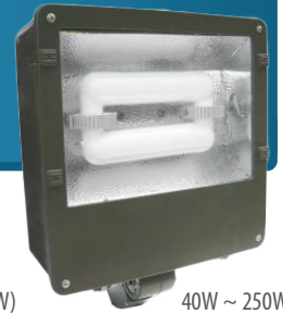
40W ~ 250W