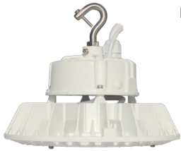
HK (Hook Mounting)