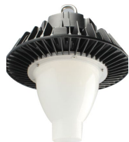
180° PC Lens SSL-UHB/PC/DIFFUSER/17UP