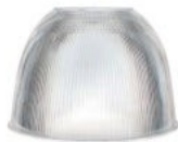
70° PC Reflector SSL-UHB/16/PC/HOOD/70D