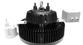
Junction Box (use with sensor) SSL-UHB/IP65JBOX