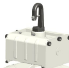
Junction Box SSL-UHB/JBOX