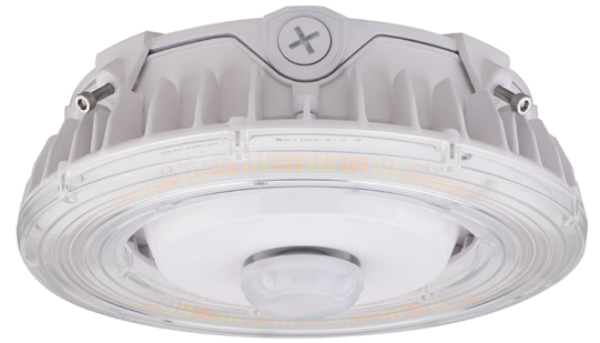
Photo shown with installed sensor