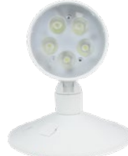
TL-EM003 (5W/ 7W)