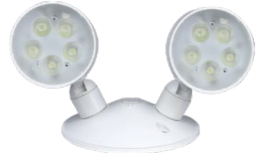
TL-EM002 (10W/ 14W)