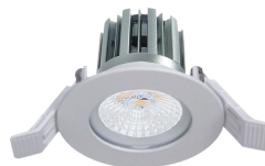
with surface trim

Operating temperature range -20 °C ~ +40 °C