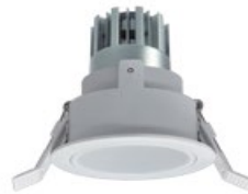
with deep trim