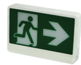
Running man sign