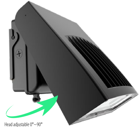
Head adjustable 0^{\circ} - 90^{\circ}