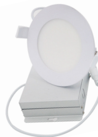
LED 4" Slim Panel PRO-SP2/4