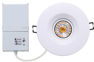
LED 4" Gimbal RGD-CHY/4